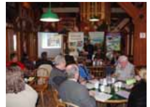
Networking & Social Events