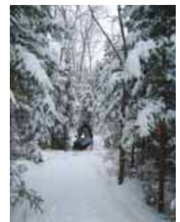
Ontario's Adventure Playground