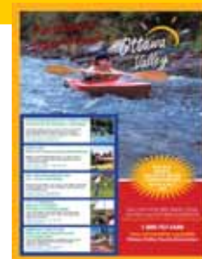
Co-operative Ad Opportunities