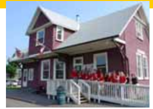
1 of 10 Visitor Centres

9 International Drive • Pembroke, ON • K8A 6W5 (T) 613.732.4364 or 1.800.757.6580 • (F) 613.735.2492 www.ottawavalley.org • adventureplayground@ottawavalley.org