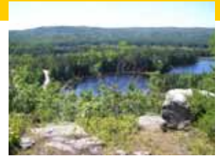
Ottawa Valley - Travel Destination