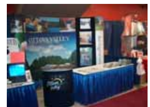
Trade Show Booth