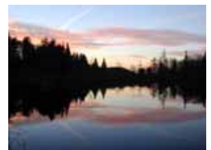
Ottawa Valley – Travel Destination