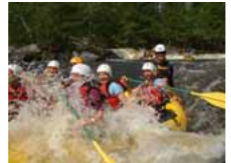
Whitewater Capital of Canada